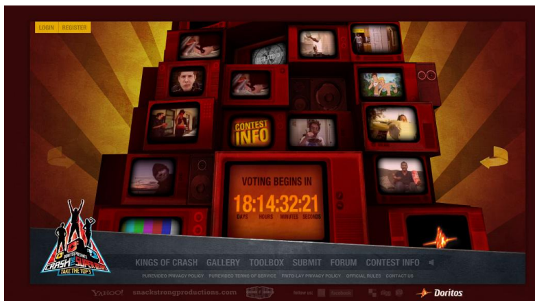
Figure 1: Doritos' Crash the Superbowl ad campaign web site