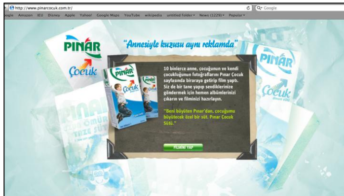
Figure 4: Pınar UGA campaign web site

Some Turkish brands such as Pınar, Turkcell, and Şölen have also initiated successful consumer-generated ad campaigns and built emotional bonds with consumers.