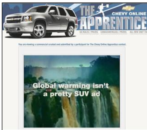
Figure 5: Example of an anti-S.U.V. activist content against Chevy Tahoe

Just like in Chevy example, where anti-branding images were used, the Internet attracts activists due to its capabilities for simultaneous interaction and easy broadcast to a large consumer audience (Krishnamurthy and Kucuk, 2009). Similarly, in 2003,