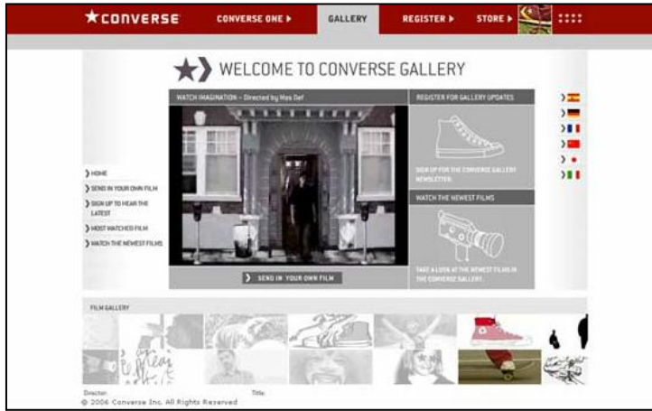
Figure 3: Converse Gallery